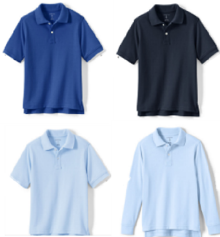
Logo Polo* (short or long sleeve)