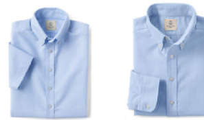
Blue Oxford SMS Logo Shirt (short or long sleeve)