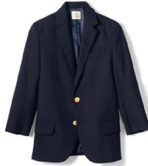
Navy Blazer Add Lands' End Embroidered Crest