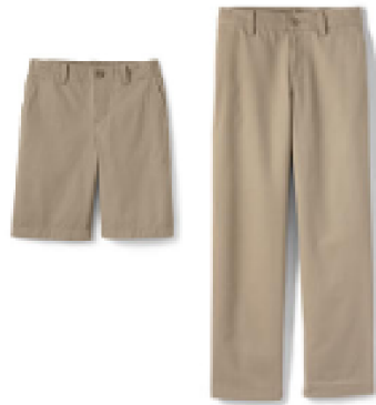
Khaki Shorts or Pants No Outside Stitching No Cargo Pants or Shorts