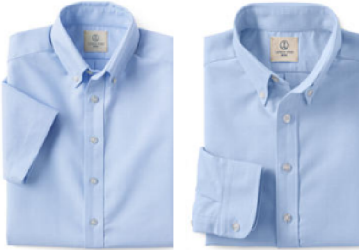
Blue Oxford SMS Logo Shirt * (short sleeve or long sleeve)