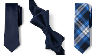
Choice of Tie: Navy tie Navy bow tie SMS Plaid tie